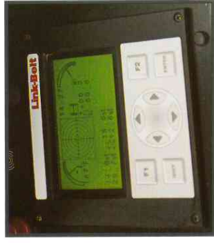
Cockpit graphic control (GGC)