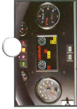
Cockpit multi-vision (CMV)