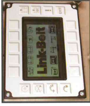
Ground control outrigger / suspension